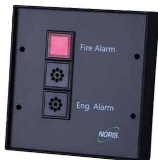
Fire alarm panel

The system is based on two PC master stations (robust industrial computers), that are operating in hot standby mode as the redundant core of the system. They acquire and monitor the measurement data of the connected signal acquisition units (SAUs), control auxiliary systems and offer both graphical mimic with gauges and bar graphs and numerical mimic with alarm list, alarm history, measuring parameter list, etc.