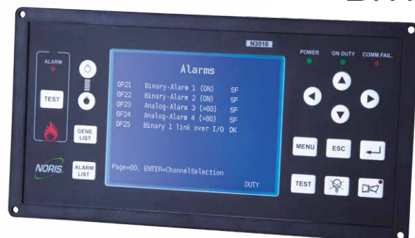
Alarm and Display Unit N3520 and Extension Alarm Panel N3510